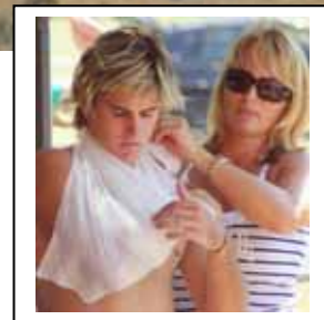
On top even after (massive?) injury at Somerset! =>